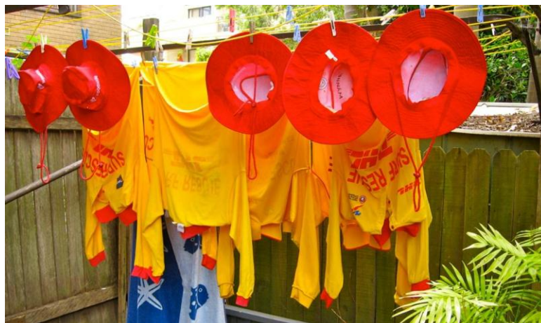
VIGILANT SAND CLEANLINESS