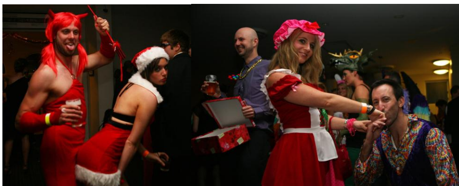
There was naughty.....