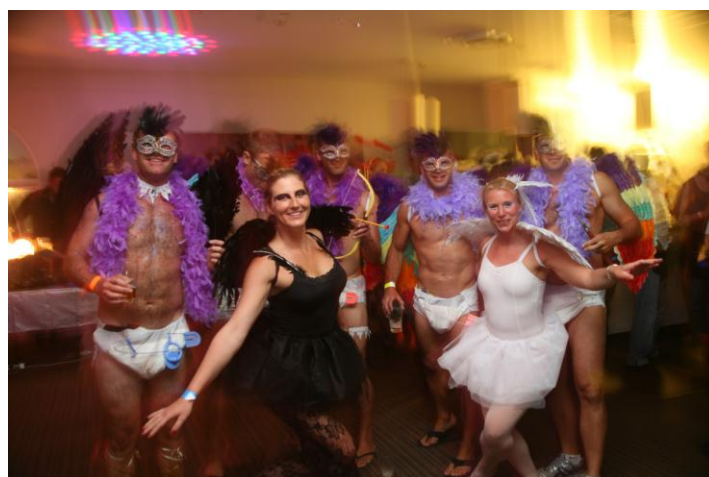
And the winning costume goes too..... Fully grown men in nappies!!! And yes, that is the Director of Education in there - leading by example!