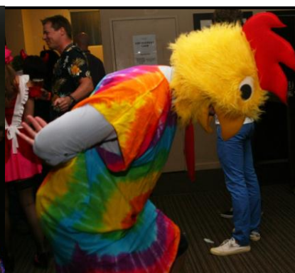
And then some things which could not be explained....